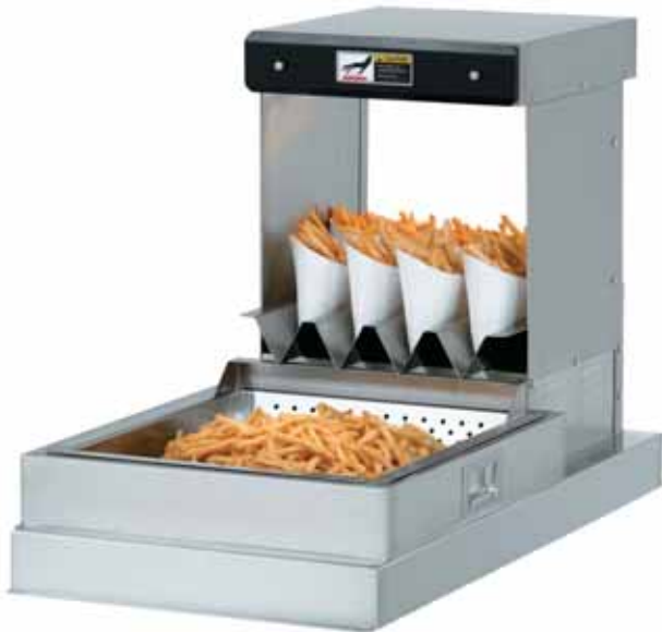
BKI's FW-12 Fry Warmer attached to Tabletop Riser