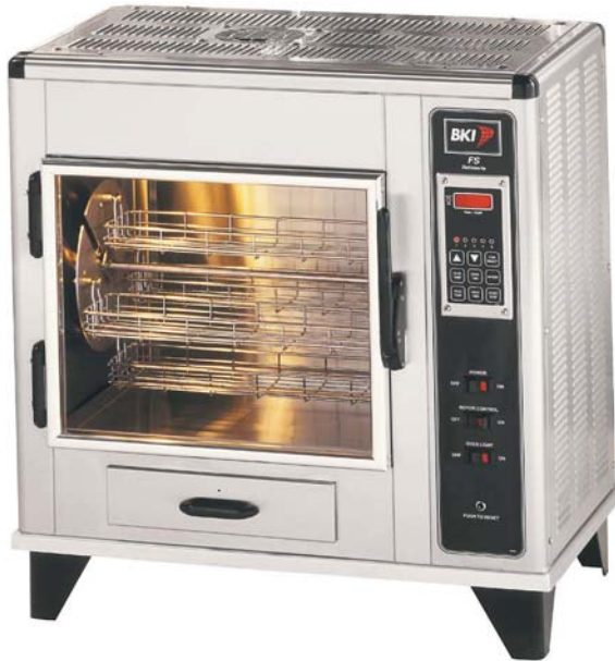
BKI's FS Rotisserie shown above