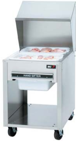
BT-24 Breeding Table shown above