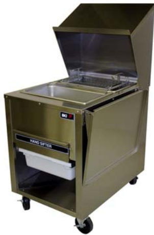
BT-24M Breeding Table shown above