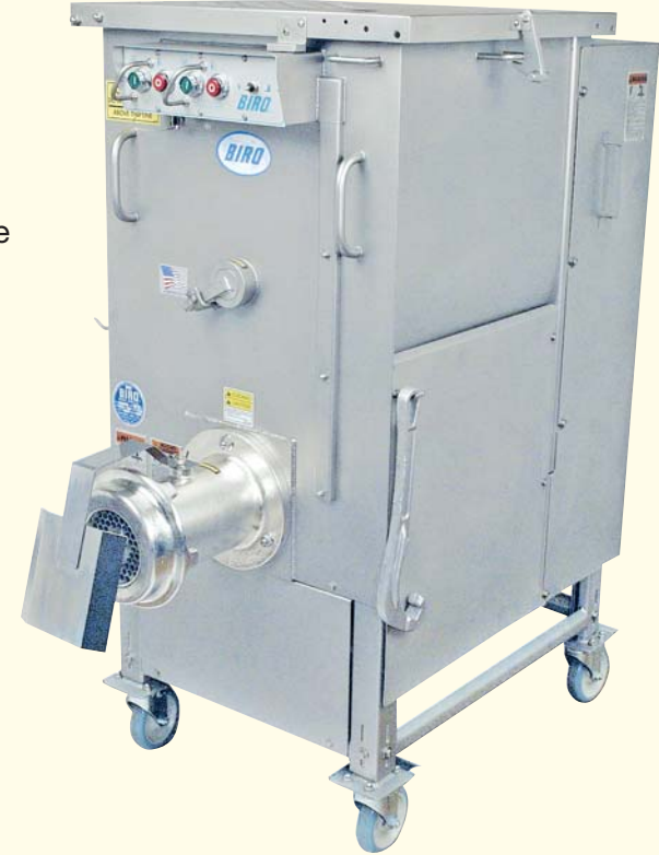
STANDARD, NO INLET

The Biro Model AFMG-52 is the ideal workhorse mixer grinder for large supermarket meat rooms and medium sized processors and HRI plants. Its 7.5 hp (5.6 kW) motor (or optional 10 hp, 7.5 kW motor) provide an output of up to 100 lbs. (45.5 kg) per minute to give you the productivity you need. The separate auger and mixer motors means there is no clutch to wear out or break, which means much lower maintenance costs and higher profits. The heavy duty roller chain auger drive with tapered roller bearings is separate from the mixer drive, to give maximum power to the auger and more efficiency. The heavy duty stainless steel 200 lb. (90.9 kg) hopper and frame resist corrosion and damage, even in an environment of harsh cleaners. Your mixer grinder lasts longer and gives you more return on your investment. Power, durability, and low maintenance help the Biro Model AFMG-52 Mixer Grinder work harder so you don't have to.