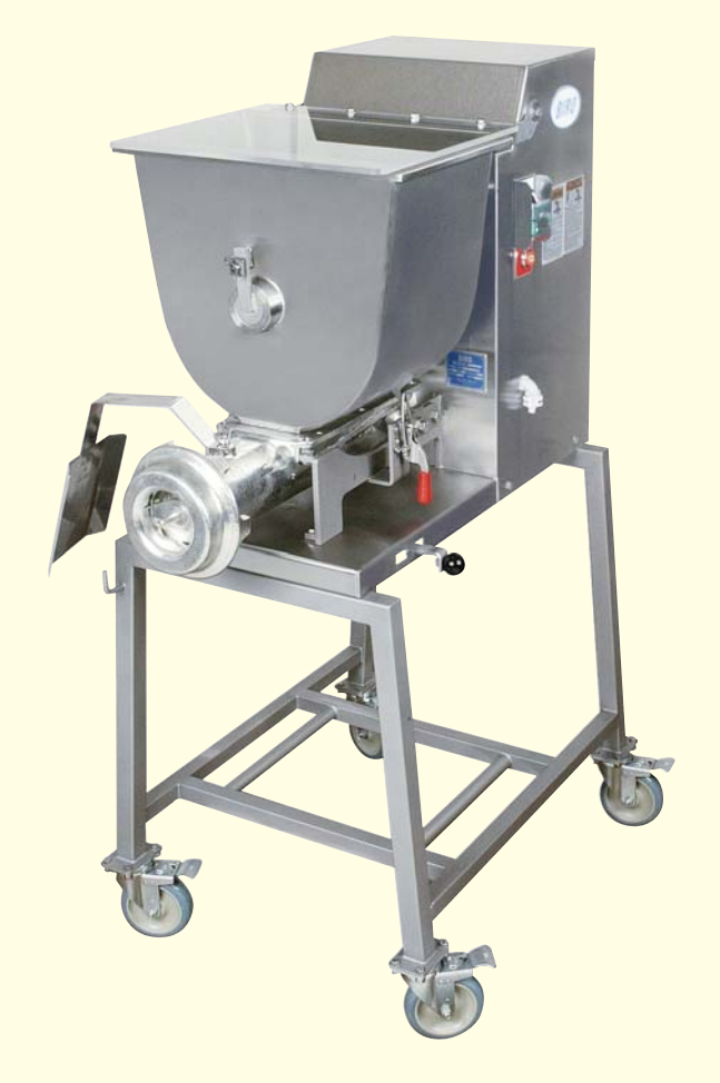
SHOWN WITH OPTIONAL EXTRA COST STAND

The Biro MINI-32 Mini Mixer Grinder makes it easier than ever to break away from the daily grind. Its 50 lb. capacity lets you grind only the amounts you need to keep the case full and still keep your grinds as fresh as possible. Now you can use the same grinder for all of your ground products without having to worry about cross contamination because the MINI-32 is so easy to clean. It's easy to disassemble, and all of the pieces are light so you can just carry all of them to the sink, wash them up, and go on to the next batch. When mounted on its specially designed cart the MINI-32 is ergonomic, so the operator doesn't have to lift a lug over their head or bend over to fill a tray. The 3 hp drive motor gives you the power you need to grind fresh ground meat, sausage, or poultry all day. So break away from the daily grind and keep your ground meat as fresh as possible with the Biro Model MINI-32.