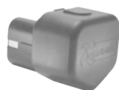
Charger and battery See machine catalogue